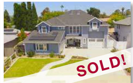
Mission Viejo $1,960,000

THERE IS A CHANGE IN THE AIR !!! IS IT TIME TO SELL ???