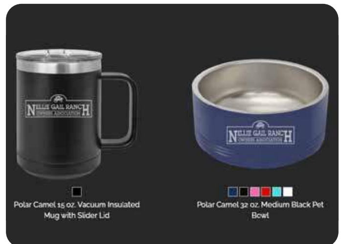
Polar Camel 15 oz. Vacuum Insulated Mug with Slider Lid