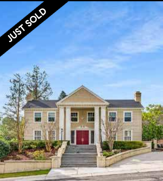
25582 RAPID FALLS SOLD FOR $4,120,000