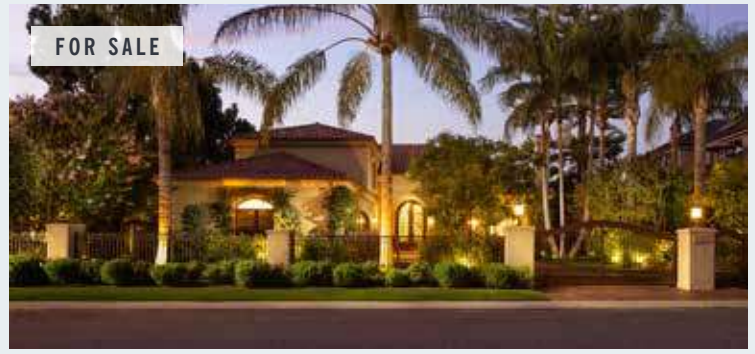
25281 DERBYHILL DRIVE LISTED FOR $3,995,000

8-BR | 11-BA | APPROX. 7,372 SF | 15,525 SF LOT