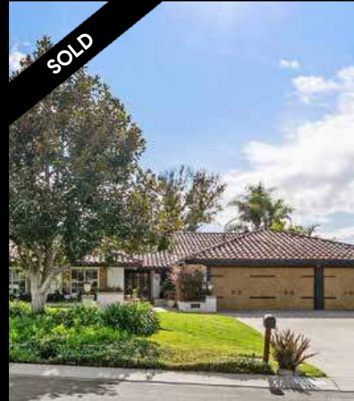
24802 RED LODGE SOLD FOR $2,500,000