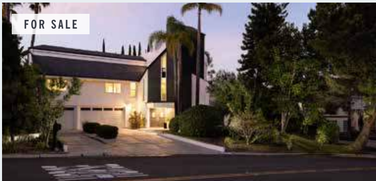
25901 NELLIE GAIL ROAD LISTED FOR $3,259,000

5-BR | 4.5-BA | APPROX. 5,018 SF | 20,000 SF LOT