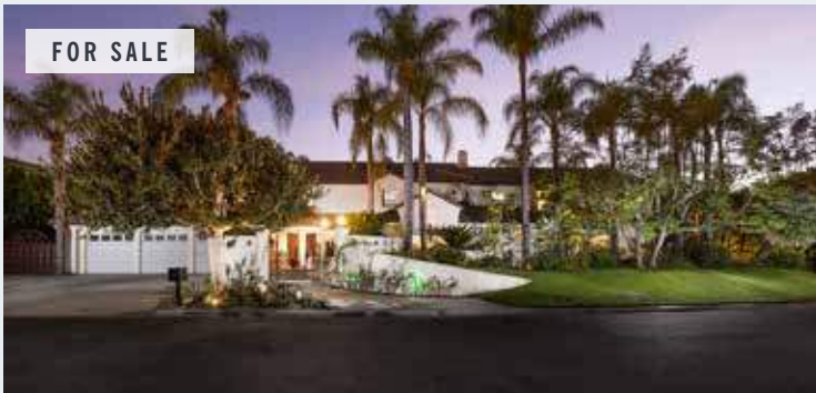
26041 SPUR BRANCH LANE LISTED FOR $4,700,000

8-BR | 11-BA | APPROX. 7,372 SF | 15,525 SF LOT