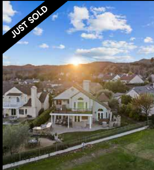
31361 SUMMERHILL SOLD FOR $1,974,000