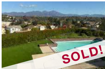
Mission Viejo $1,830,000