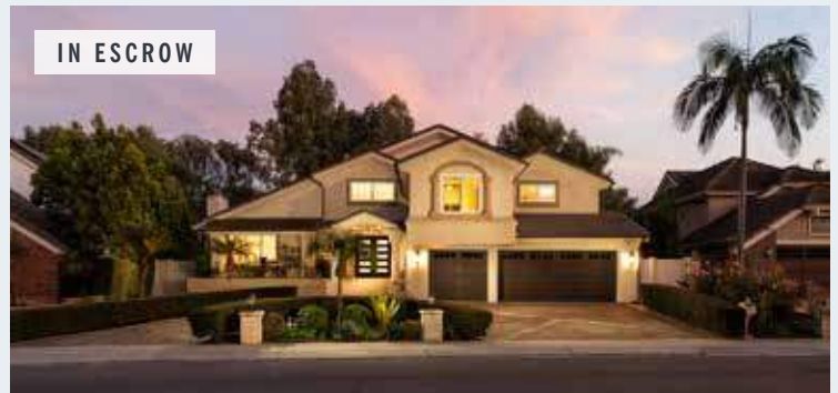
27773 HIDDEN TRAIL ROAD LISTED FOR $3,195,000

6-BR | 4.5-BA | APPROX. 4,700 SF | 10,496 SF LOT