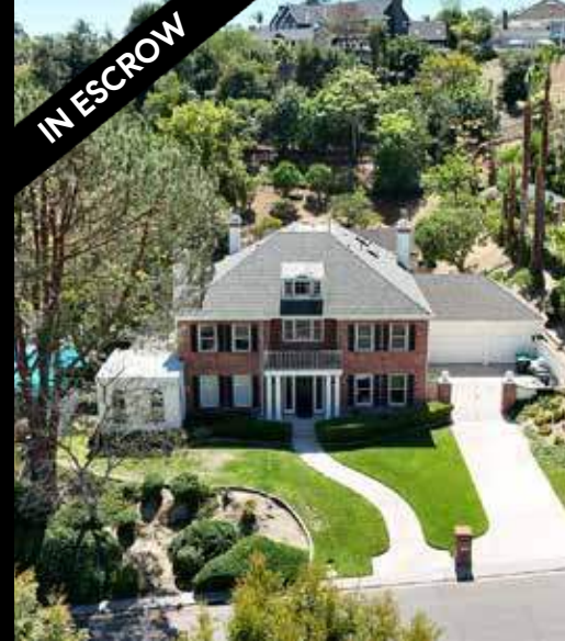
25602 RAPID FALLS OFFERED FOR $3,290,000