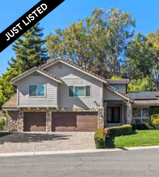
27215 STAGEWOOD OFFERED AT $3,250,000