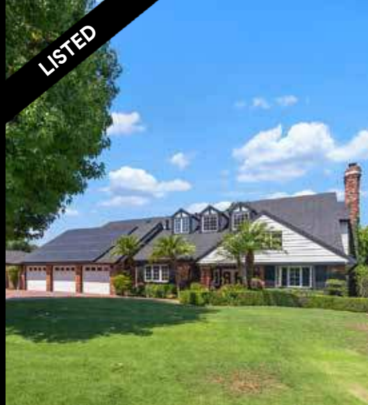
27101 SHENANDOAH OFFERED AT $3,400,000