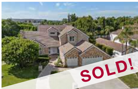
Nellie Gail Ranch $2,525,000

Proud to be a Nellie Gail Homeowner for 40 years! No broker residing here has sold more Nellie Gail Homes.