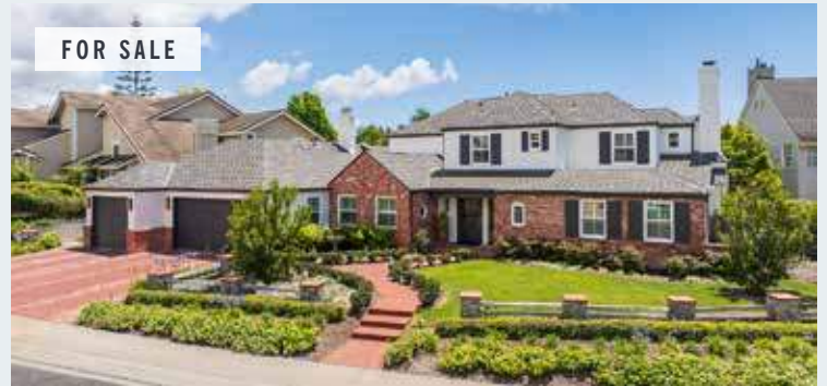
25402 GALLUP CIRCLE LISTED FOR $4,500,000

8-BR | 11-BA | APPROX. 7,372 SF | 15,525 SF LOT