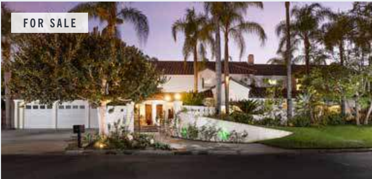
26041 SPUR BRANCH LANE LISTED FOR $4,700,000

8-BR | 11-BA | APPROX. 7,372 SF | 15,525 SF LOT