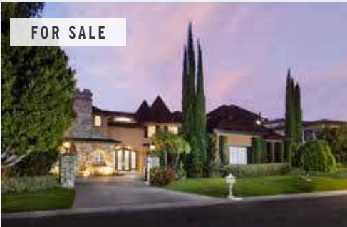
25761 HIGHPLAINS TERRACE 5-BR | 6-BA APPROX. 5,805 SF | 19,350 SF LOT LISTED FOR $3,650,000

4-BR | 4.5-BA | APPROX. 5,000 SF | 17,000 SF LOT