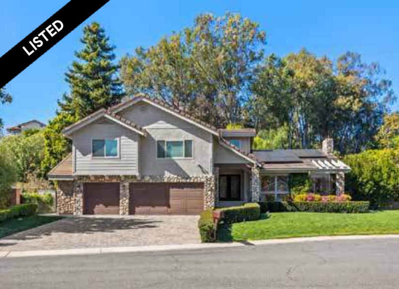
27215 STAGEWOOD OFFERED AT $3,250,000