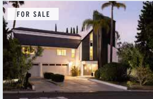
25901 NELLIE GAIL ROAD 6-BR | 4.5-BA APPROX. 4,700 SF | 10,496 SF LOT LISTED FOR $3,259,000