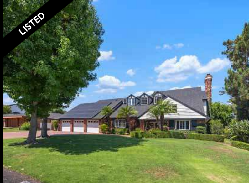
27101 SHENANDOAH OFFERED AT $3,260,000