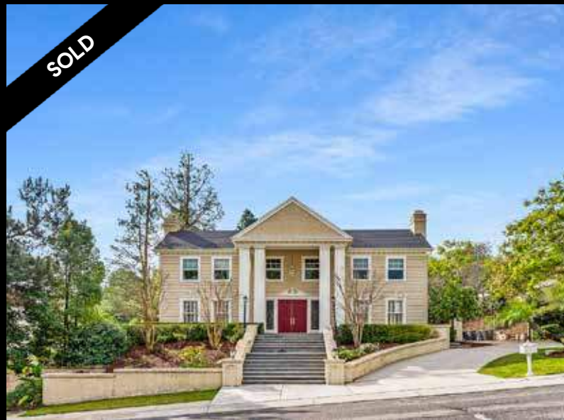
25582 RAPID FALLS SOLD FOR $4,120,000