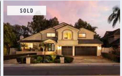
27773 HIDDEN TRAIL ROAD 5-BR | 4.5-BA APPROX. 3,886 SF | 21,600 SF LOT SOLD FOR $3,072,500

CURIOUS WHAT YOUR NELLIE GAIL HOME IS WORTH?