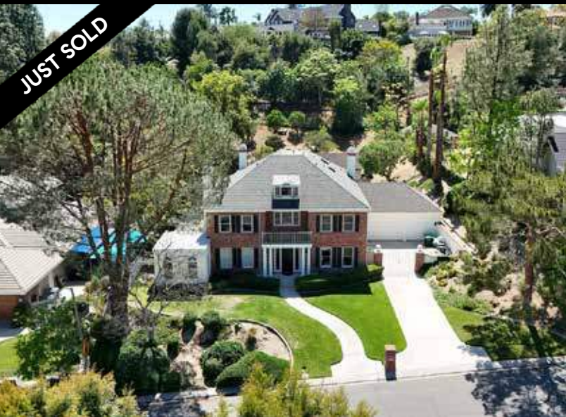
25602 RAPID FALLS SOLD FOR $3,245,000